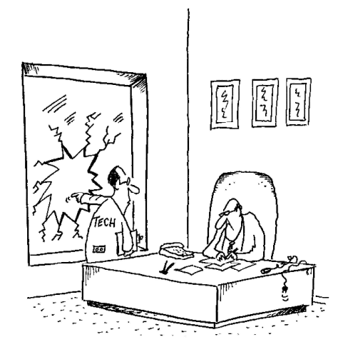
"Is that computer, down there, the one you were having problems with?"

Call us right now with your answer! (502) 225-4303