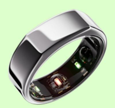
Oura Ring Generation 3

For the past few years, fitness trackers have become all the rage. Between Fitbits and the Apple Watch, nearly everyone has or is familiar with fitness trackers. One of the most common complaints about many fitness trackers is comfort. Oura decided to take the wristband out of the equation with the Oura Ring. The Oura Ring is a fitness tracker that you wear on your finger. It tracks sleep, activity and readiness measurements. This device is even more accurate than other fitness trackers since the finger is a better spot to record heart-rate data. Through temperature sensors, a library of informational resources and much more, the Oura Ring is the perfect fitness tracker for just about anyone who is looking to improve or maintain their physical health.