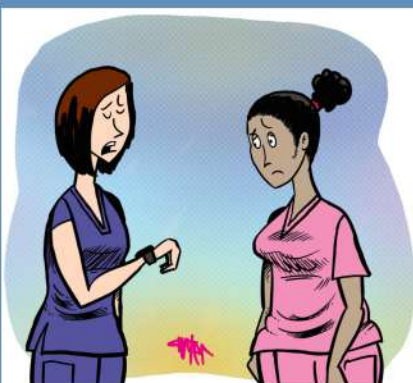
"A hacker logged into my fitness tracker and stole all my steps!"

Discover What Most IT Consultants Don't Know Or Won't Tell You About Moving Your Company's Network To The Cloud