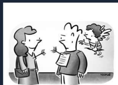
"If you could fill out the attached survey that would really help me out."

Claim Your FREE Copy Today At www.TransitionalTechnologies.com/itbuyersguide